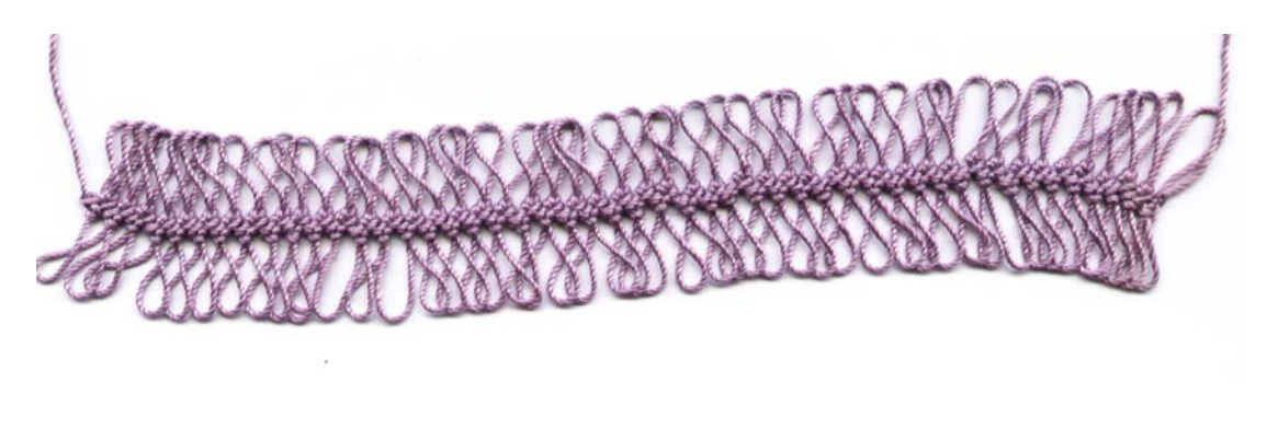
Remove lace from loom