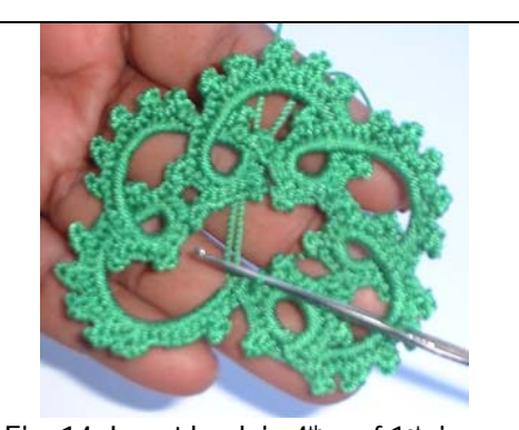
Fig. 14: Insert hook in 4<sup>th</sup> p of 1<sup>st</sup> ring, reinsert hook in dropped loop and pull through p. Remove hook from loop, pull cording

Remove hook from loop, pull cording forward, reinsert hook in dropped loop from behind cording