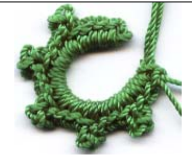
Fig. 6: After working: (p, 3 sc) 5 times. Remove hook from loop, turn work so that the 1st four sc made are facing front.