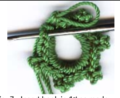
Fig. 7: Insert hook in 1st sc made. Reinsert hook in dropped loop and pull through sc.