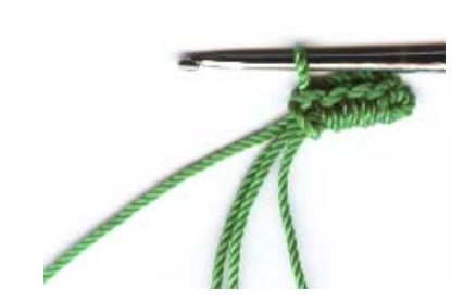
Fig 2: Work over running thread. 4 sc.