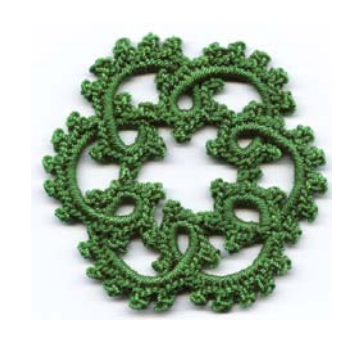
Fig 21: Completed Corded Motif