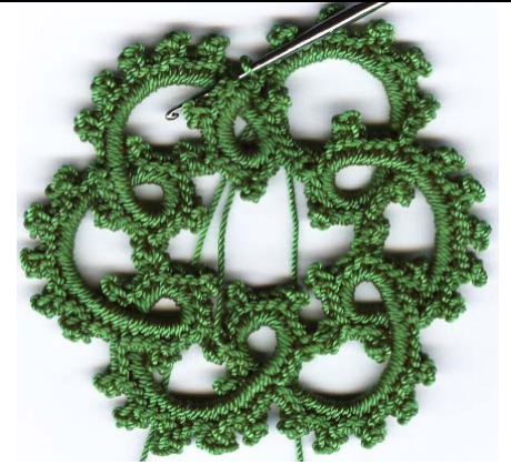
Fig. 17: (3 sc, p), 5 times, 3 sc, SI st in 1st sc of 1st ring.