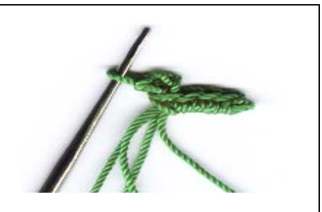
Fig. 5: Completed p (picot).