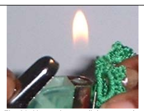
Fig. 20: Use a cigarette lighter to melt ends, quickly press the melted ends on work.