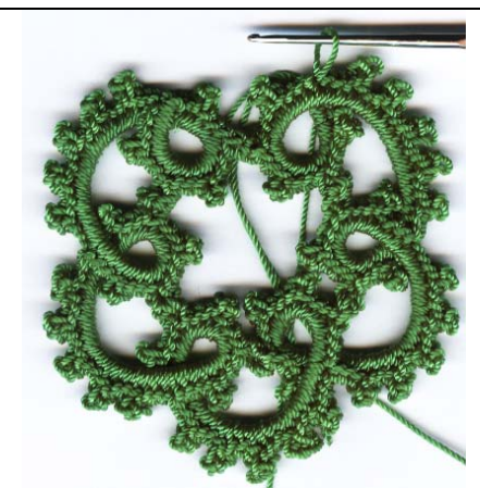
Fig.16: 3 sc, p, 3 sc, SI st in 4th of 7 sc.