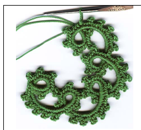
Fig. 12: (Repeat step 01) 4 times At this point you should have 5 rings and 4 bars