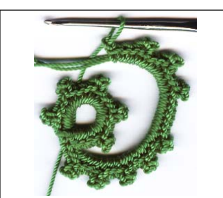
Fig. 9: (3 sc, p), 5 times, (bar), 7 sc, (p, 3 sc), 3 times