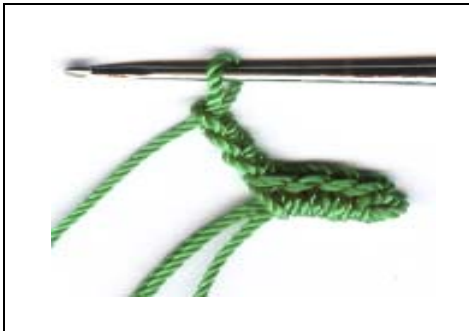
Fig. 3: Ch 3.