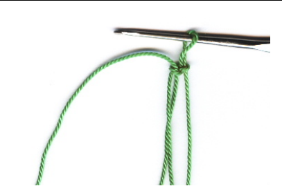
Fig 1: Cut length of nylon crochet thread 34 inches long; fold thread in two, (17 inches). (This will be your running thread). Attach ball thread to folded end of running thread with a starting ch st.