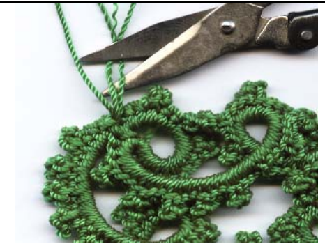
Fig. 19: Turn work to the wrong side insert hook in 1st sc of 1st ring, hook all three strands of thread and pull through to the back of 1st ring, pull tightly on all strands, check the front of work to make sure that work looks neat and even. Cut threads approx. ¼ in. or shorter.