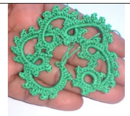
Fig. 13: (3 sc, p), 5 times, 7 sc, p, 3 sc, jp in 4<sup>th</sup> p of 1<sup>st</sup> ring