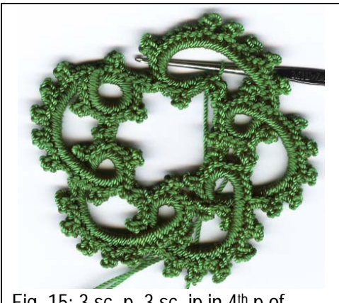
Fig. 15: 3 sc, p, 3 sc, jp in 4<sup>th</sup> p of previous ring,

Remove hook from loop, pull cording forward, reinsert hook in dropped loop from behind cording