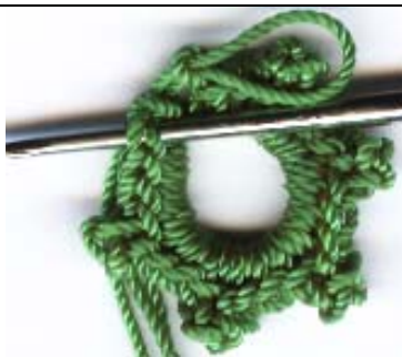
Fig. 7: Insert hook in 1 st sc made. Reinsert hook in dropped loop and pull through sc.