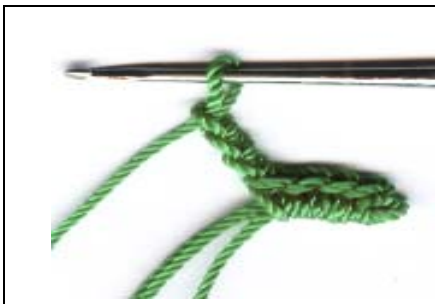
Fig. 3: Ch 3.