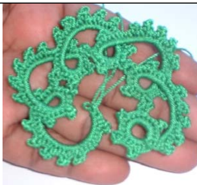
Fig. 13: (3 sc, p), 5 times, 7 sc, p, 3 sc, jp in 4 th p of 1 st ring