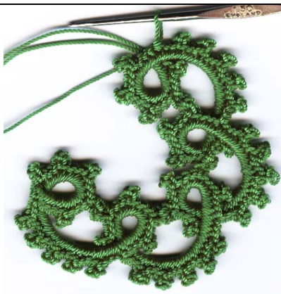
Fig. 12: (Repeat step 01) 4 times At this point you should have 5 rings and 4 bars