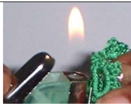
Fig. 20: Use a cigarette lighter to melt ends, quickly press the melted ends on work.