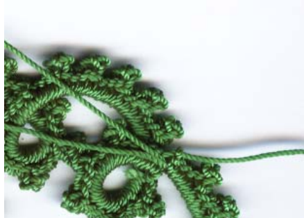
Fig. 18: Cut ball thread, You have three strands of thread to hide.