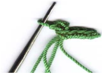
Fig. 5: Completed p (picot).