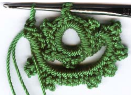
Fig. 10: Ch 1 Remove hook from loop, working from behind bar Insert hook in 2 nd p of 1 st ring, reinsert hook in dropped loop and pull through p, ch 2, Sl st in last sc made