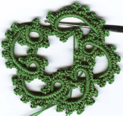
Fig. 15: 3 sc, p, 3 sc, jp in 4 th p of previous ring,