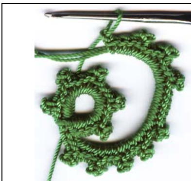
Fig. 9: (3 sc, p), 5 times, (bar) , 7 sc, (p, 3 sc), 3 times