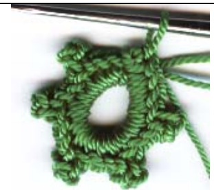
Fig. 8: (Ring completed) Hold ring in left hand between thumb and index finger, pull on both strands of the running thread. This will pull the stitches closer together giving you a tight neat ring.