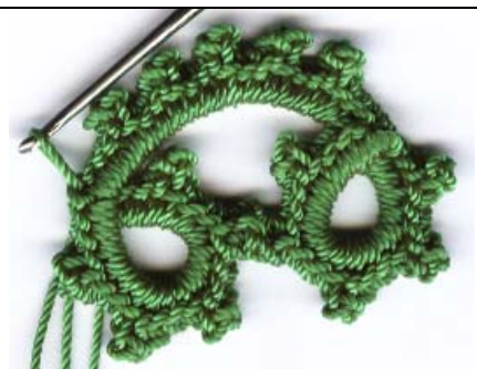
Fig. 11: Continue working from behind bar 3 sc, p, 3 sc, Remove hook from loop, insert hook in 4 th of 7 sc from the front of bar , reinsert hook in dropped loop and pull through. (2 nd ring completed)