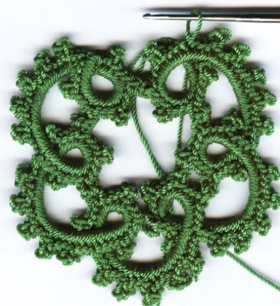
Fig. 16: 3 sc, p, 3 sc, Sl st in 4 th of 7 sc.