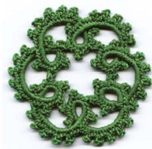
Fig 21: Completed Corded Motif