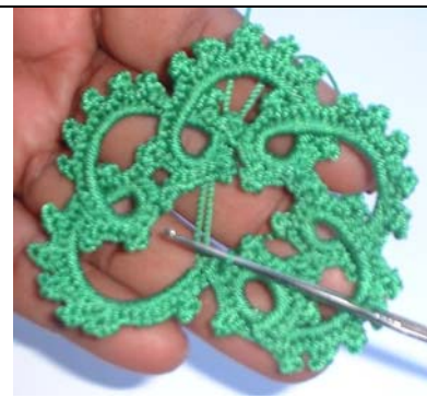
Fig. 14: Insert hook in 4 th p of 1 st ring, reinsert hook in dropped loop and pull through p. Remove hook from loop, pull cording forward, reinsert hook in dropped loop from behind cording