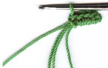
Fig 2: Work over running thread. 4 sc.