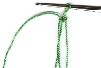
Fig 1: Cut length of nylon crochet thread 34 inches long; fold thread in two, (17 inches). (This will be your running thread). Attach ball thread to folded end of running thread with a starting ch st.