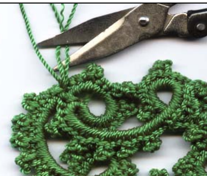
Fig. 19: Turn work to the wrong side insert hook in 1 st sc of 1 st ring, hook all three strands of thread and pull through to the back of 1 st ring, pull tightly on all strands, check the front of work to make sure that work looks neat and even. Cut threads approx. ¼ in. or shorter.