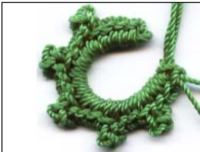
Fig. 6: After working: (p, 3 sc) 5 times. Remove hook from loop, turn work so that the 1 st four sc made are facing front.