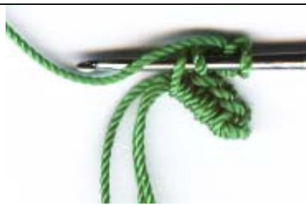
Fig 4: Sl st in last sc made.